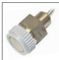
High temperature sensor for combustible gases