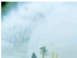
Excel penetrates water curtain