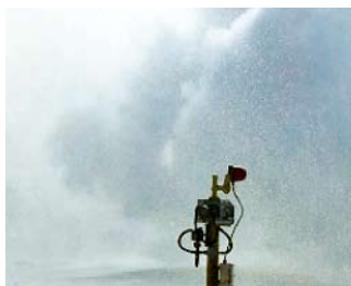
... and gas cloud.