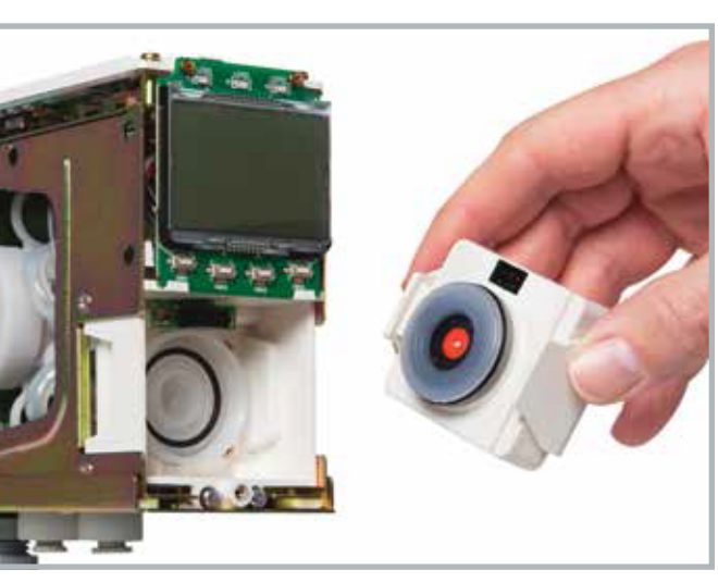
Midas Gas Detector plug-and-play sensor cartridge allows quick and easy sensor replacement